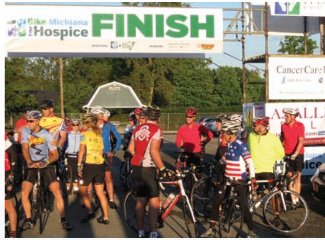
Cyclists gathered early on Sunday morning to enjoy a spectacular sun-filled Michiana day.

The fun did not end when the ride was over. A post-ride party at the park provided a perfect opportunity to unwind, refresh and gather with friends. The post-ride