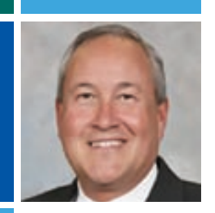
Chief Operating Officer