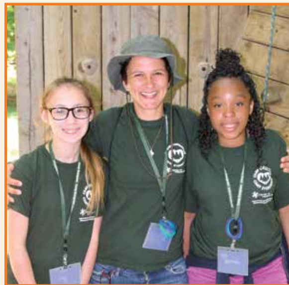
Two major aspects of the Crossroads Campaign were expanding the endowment funds for signature Center for Hospice Care bereavement programs Camp Evergreen (left) and After Images art counseling (right).