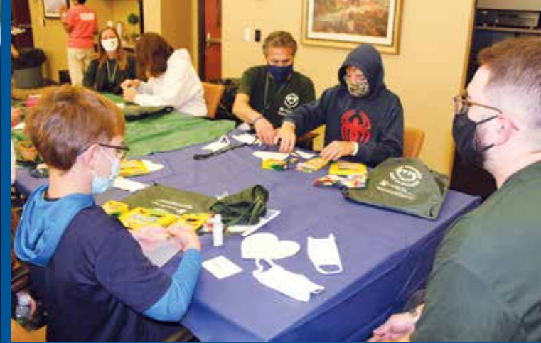
Essential programs funded by the "Cornerstones for Living: the Crossroads Campaign" include (left to right) the After Images art counseling program, "We Honor Veterans," and Camp Evergreen.