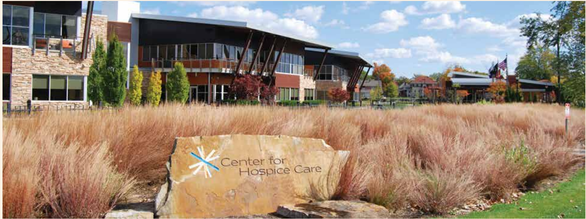
Center for Hospice Care's Mishawaka Campus consolidates several leased spaces and makes our care facility more centrally located in our service area.